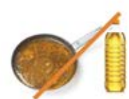
Fats, Oils & Grease