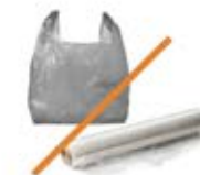
Plastic Bags & Wrap