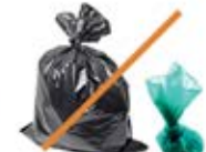
Trash & Pet Waste

PRESORTED STANDARD U.S. POSTAGE PAID GREENFIELD, IN PERMIT NO. 220